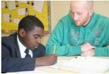
St. Marcus student working on homework with his tutor.

It's a formula first proven successful at St. Marcus Lutheran School. The school offers loving relationships with Christ-modeling adults, high expectations, close accountability, and intense academic support. The